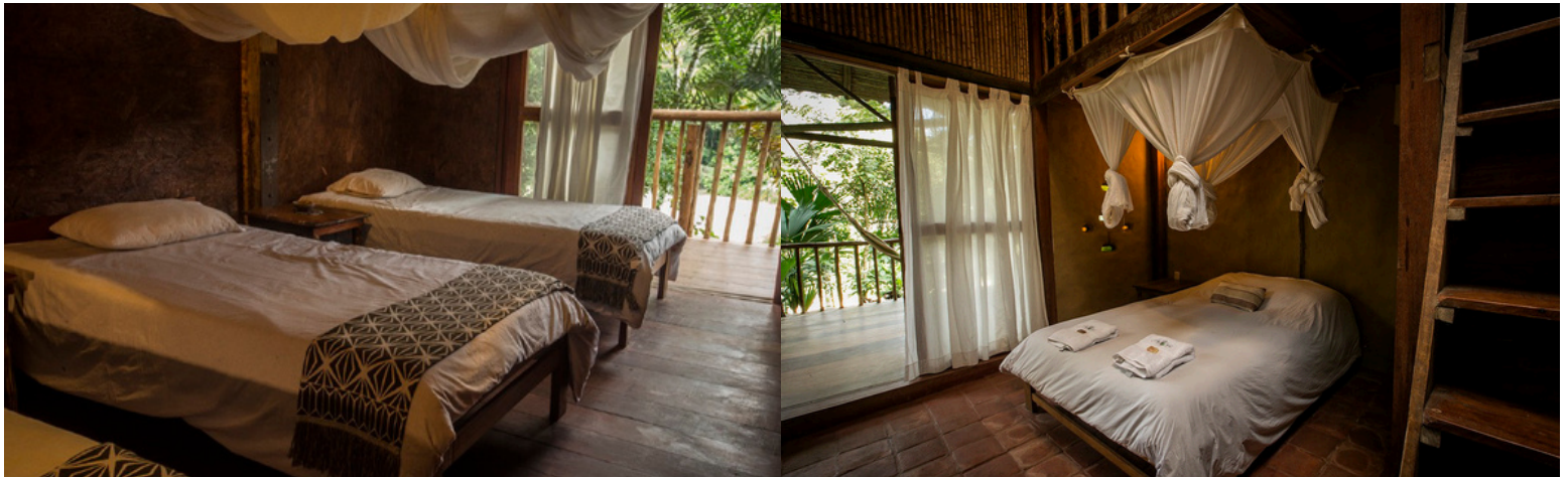
Double room | $1800 & fees

3 people maximum. | Shared bathrooms (3 showers, 2 cubicles), outside the room. | Located in the upper part of the lodge, next to the Maloca (main room for the sessions), a 10 minute walk up a mountain path.