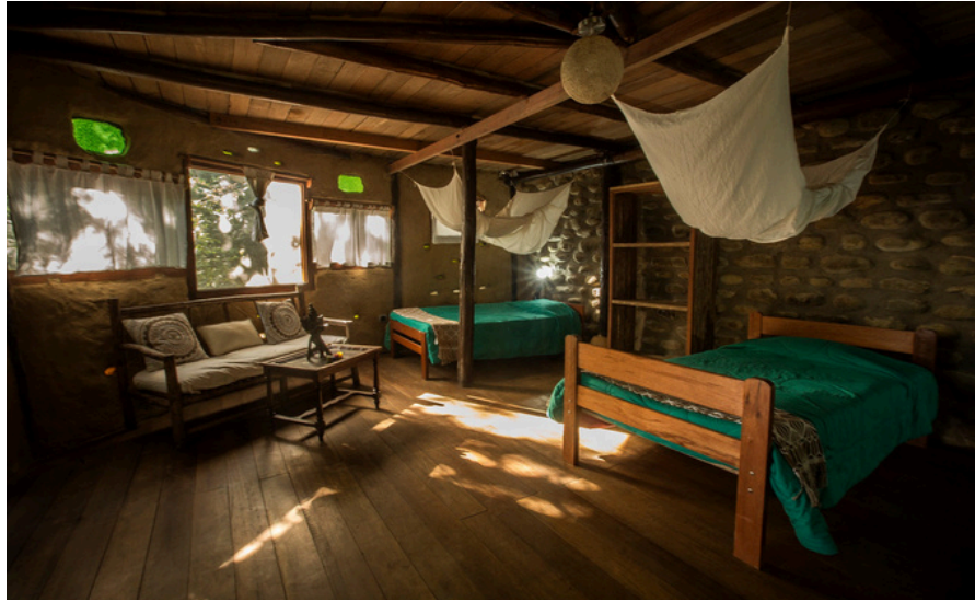
Shared Room | $1650 & fees

PRICE PER PERSON. THIS ROOM IS AVAILABLE ACCORDING TO THE CAPACITY OF THE RETREAT OR IF YOU WOULD LIKE TO STAY IN THE UPPER PART OF THE LODGE.